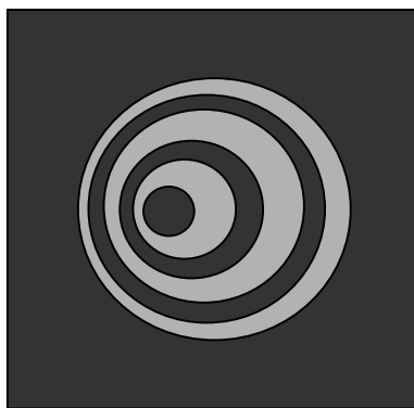
Figure 4. Star pattern of uncollimated scope.