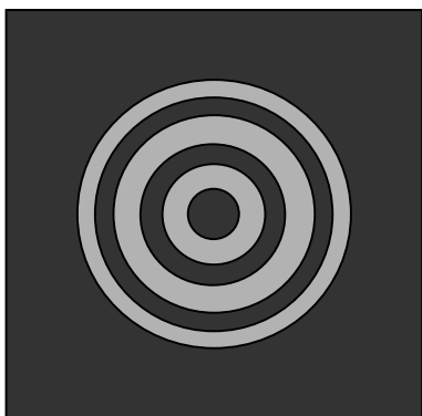
Figure 3. Star pattern of collimated scope.

At this point your scope will probably be out of collimation (Figure 2). Now tighten and loosen appropriate knobs until the mirrors and their reflections are once again concentric (Figure 1), and the secondary mirror is held securely. If a knob becomes harder to turn when tightening, loosen the opposite knobs slightly instead. Check your owner's manual for additional guidance for your particular scope.